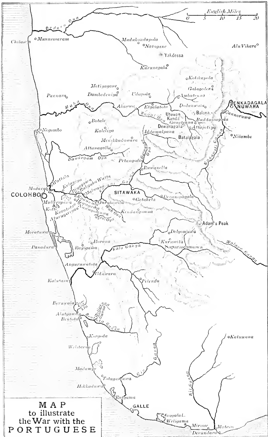
MAP to illustrate the War with the PORTUGUESE